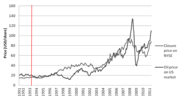
Graph 4. Statement of the Exxon Mobil company's closing prices on the NYSE and oil prices in the years 1991 - 2011. Source: Own calculations based on Reuters quotes:

http://www.reuters.com/finance/stocks/chart?symbol=XOM.N , and the prices of crude oil: