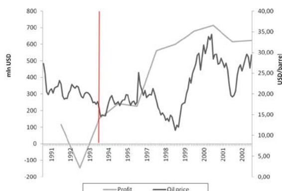
Graph 1. Summary of financial results of Mobil USM&R and oil prices on the U.S. market in the years 1991 - 2002. Source: data set.

products arising as a result thereof. Taking into account that analyzed division is a part of the company which extract crude oil in quantities that meet its own refining needs, it can be concluded that in this case the raw material supplier policy impact on financial results is negligible. It should be also noticed that for a company functioning on a highly competitive market, the market price of its basic raw material has a significant impact on the financial results of a particular company, because it determines the action of competition, while providing a basis to develop a margin which is the main source of profit. In such situation, in order to properly assess the effects of the implementation of Balanced Scorecard in the oil company, it seems necessary to compare the results of the analyzed division with the oil prices. Graph 1 show the financial result of Mobil USM & R (in annual terms), along with oil prices recorded on the U.S. market (on a monthly basis) in 1991-2002.