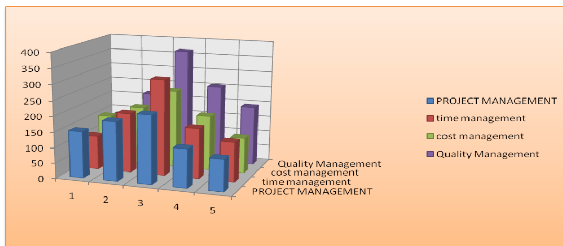
Figure 1: summarizing qualitative assessment of the standard in IRAN projects (1) Very low, (2) low, (3) average, (4) high, (5) very high