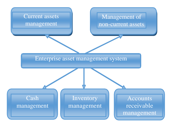
Figure 1 – The structural asset management system of the enterprise [23]

Analysis of fig. 1 shows that asset management in any enterprise is an important element that covers a wide range of tasks. It should also be noted that the policy of managing cash, inventories, and receivables is part of the general system of current assets management policy, so we will consider asset management as consisting of two main blocks – management of current and non-current assets.