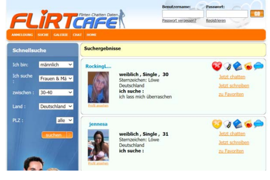
Figure 1 – German dating site: registration page

The dating site FlirtCafe provides its users with free trial registration for ten days, which allows them to see their guest list, other users' profiles, the photo gallery, and sent them messages in the chat. After this trial period, accessible functions are restricted to looking through only one profile a day. To register, the user has to provide the username, e-mail, password, date of birth, postcode, sex, the sex of a would-be partner. The site allows registration for people aged from 16 to 60 and older. After registration, it is obligatory to provide detailed personal information (general information, describing oneself, outlining the requirements for a potential partner, one's appearance, a favourite pastime, autobiography). The field where the user provides their Nickname is obligatory, and the Nickname will be visible with the avatar (if there is any) and with a quick search even to unregistered users (see Figure 1).