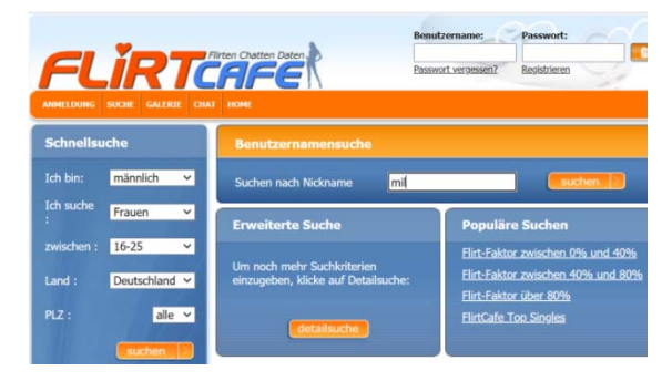
Figure 2 – German dating site: the focus is on the Nickname Search field

There are also options for searching with the help of nicknames. To do it, you need to enter some letters, and in the Search field, you will see all aliases containing this combination of letters (see Figure 2).