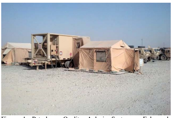
Figure 1. Petroleum Quality Anlysis System – Enhanced, Author: Sgt. George W. Slaughter

The aim of the paper is to present the concept of a mobile PHM laboratory, including a comparison with currently used systems.