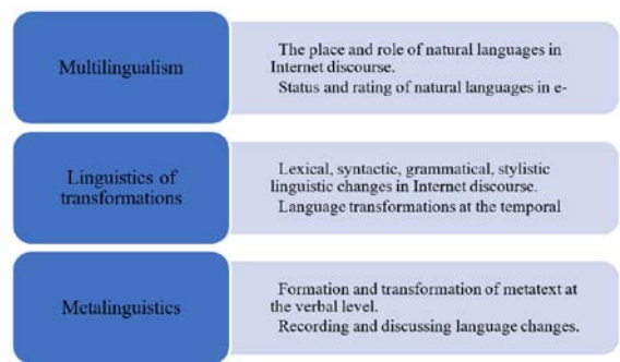
Figure 1. The primary directions of research in Internet linguistics

During the research (stage I), the research team successfully identified the primary research issues concerning the examination of Internet discourse as a subject of contemporary linguistic investigation (Figure 1). The field of modern linguistics encompasses several principal directions of study.