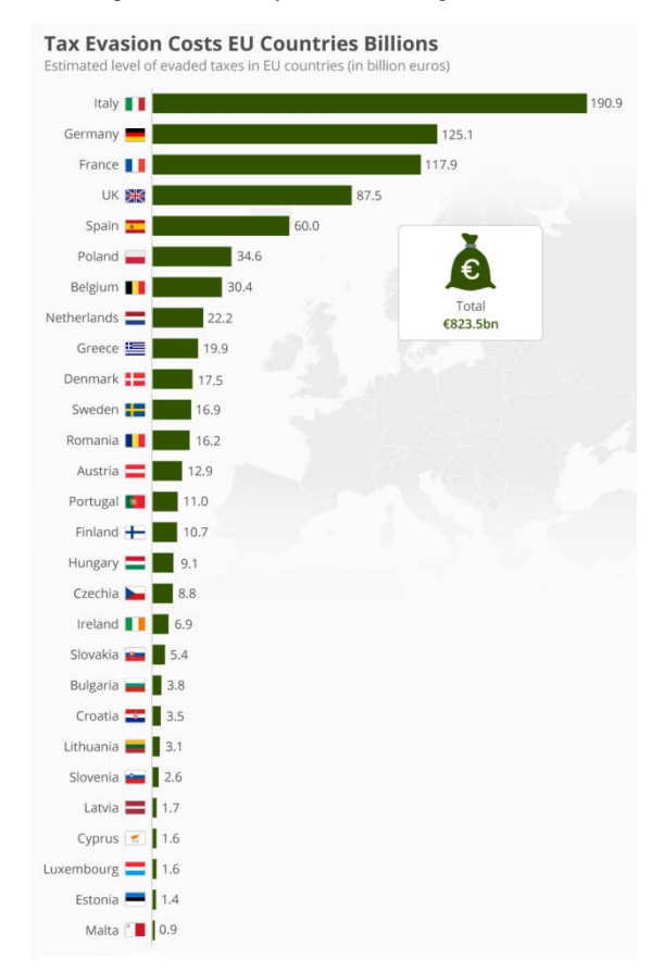
Figure 2. Estimated level of evaded taxes in EU countries (in billion years) [1]

The information displayed in this infographic (see Figure 2) is the best estimate; according to Murphy, the total may range from 750 to 900 billion euros throughout the EU. In terms of percentage terms, Italy evades the biggest portion of this, followed by Germany and France. With 47% of GDP, Denmark is in first place, followed by Austria and Belgium.