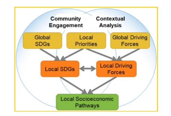
Figure 1. The process of localizing SDGs and driving forces to create local socioeconomic pathways [58]

Szetey et al. (2021) [58] propose conceptual scheme depicting the process of localizing SDGs and driving forces to create local socioeconomic pathways (see Figure 1).