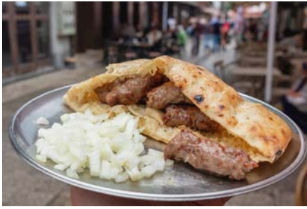
Fig. 2 Authentic and preserved gastro-brand "Sarajevski ćevapi" – the most popular traditional meal in Sarajevo

Gastronomy features on numerous different tours, and each garnered a relatively high number of votes from travelers, indicating the strong attraction and popularity of culinary experiences among Sarajevo visitors. This finding underscores the importance of including local cuisine in tourist packages because authentic dishes and gastronomy excursions assist visitors to gain a deeper understanding of the destination's culture and traditions. The study of Žunić and Nezirović (2022) also found positive results toward the overall satisfaction with gastronomy attributes and gastronomy as a travel motive, with an excellent rating of the gastronomic supply, accounting traditional Bosnian dishes as an important brand and vital part of tourism supply. Gastronomy and tours of cultural and historical monuments are often connected through thematic tours that provide a comprehensive experience of the destination.