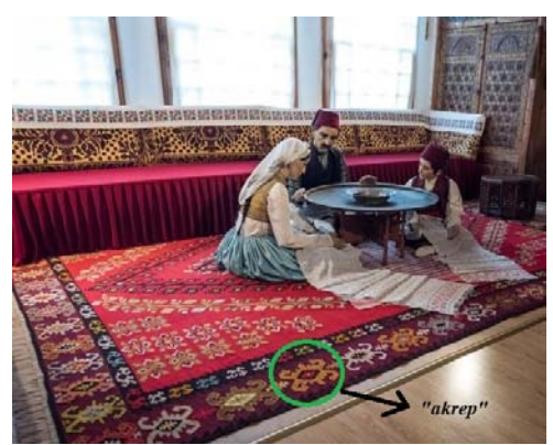
Fig. 7 Bosnian carpet with its ancient symbolic motif of "akrep" (marked with green circle), the National Museum exhibition

The Bosnian carpet, with its rich artistic ornamentation and color, combines the influences of the Orient/Far East and indigenous Balkan elements, with "akrep" for the central motif. Various sources interpret "akrep" differently: some associate it with the turtle from ancient religions and the influence of Kazakhstan and Azerbaijan, while others associate it with the scorpion from Zoroastrianism and Persian influence, which shared elements with Balkan Illyrian beliefs and folk practices. The National Museum of Bosnia and Herzegovina is home to the rare collection of more than 100 samples of Bosnian carpets.