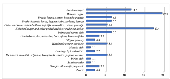
Fig. 5 Knowledge of local specialties, craft products and souvenirs by foreign tourists in Sarajevo (%)

Figures 5 and 6 show tourist knowledge of local gastronomic, craft, and artistic products, some of which can be bought as souvenirs. Respondents from Bosnia and Herzegovina and nearby countries differ significantly from those from faraway countries. Locals and tourists from the region are much more familiar with local products, which include Bosnian coffee, kebabs (ćevapi) and other meat dishes from the spit and grill, dolma and sarma, pies, traditional sweet dishes, and Bosnian rugs. Other foreign tourists are less familiar with the listed items, but Bosnian coffee and kebabs (ćevapi) are the most well-known.