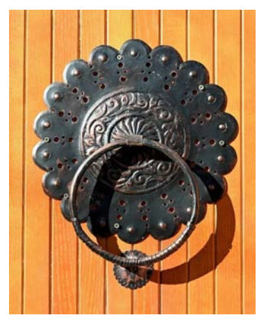
Fig. 8 Zvekir, a traditional iron ring bell—the urban symbol of craftsmanship, power, and hospitality