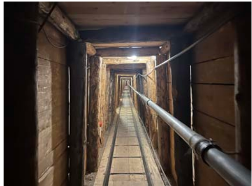
Fig. 4 Sarajevo War Tunnel of Hope—the symbol of the longest urban siege in contemporary history of Europe (Authors. Photo by CA Author)