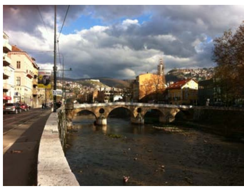
Fig. 3 The Latin or Principov Most (bridge) in Sarajevo, the symbol of the "Sarajevo Assassination" (1914)—the" trigger of the First World War (Authors. Photo by CA Author)

foreign tourists emphasize the importance of adapting tourist offers to different target groups. While domestic tourists may prefer tours that involve nature excursions or explore lesser-known locations, foreign tourists are often more interested in globally known historical events and landmarks. Understanding these differences can help travel agencies better structure their offers and marketing strategies to attract a wide range of tourists and satisfy their specific interests.