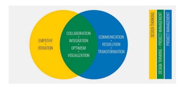
Figure 2. Relationship between the principles of DT and PM [4]

The project manager accepts permanent and formal responsibility for ensuring the best possible outcome for a DT project. The inclusion of management concerns like as integration, scope, schedule, cost, quality, resource, communication, risk, procurement, and stakeholder will reduce the superficiality of DT while increasing trust and credibility as new phases and management tools are introduced throughout the process. Figure 2 shows the relationship between the DT and PM ideas.