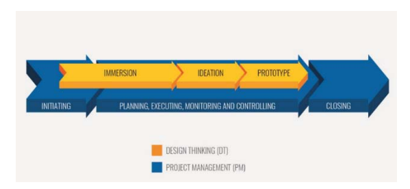
Figure 3. Phases of Design Thinking Project Management framework [4]

Phases of the framework proposed by Canfield and Bernandes are given in Figure 3.