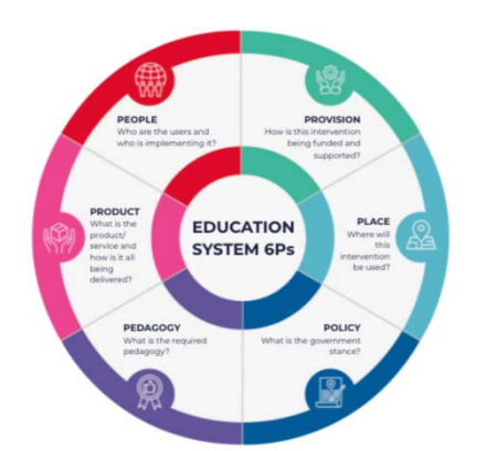
Figure 3. 6Ps Framework for Digital Technology [28]

In an attempt to help academics, practitioners, and policy makers figure out what is and is not working, the framework places a strong emphasis on the interactions between each of the six components.