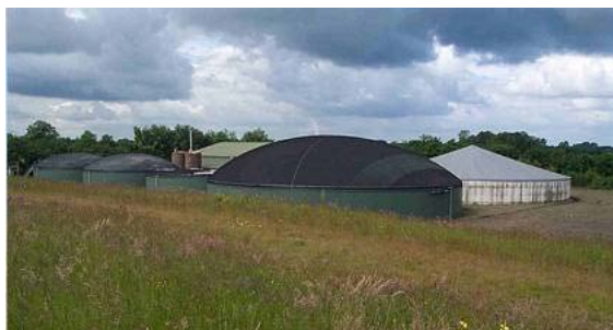
Fig. 4. Manure co-digestion plant, Beltrum, Netherlands

Digestate is used as fertilizer and has, compared to undigested manure, an added value as fertilizer. To improve the biogas efficiency, so-called co-substrates are often added to the digester. This can be dedicated energy crops such as corn, but often waste products from food industry are used.