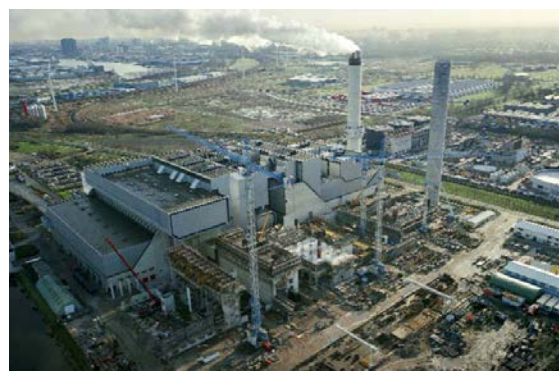
Fig. 3. Waste incineration plant, Amsterdam, Netherlands

applied in waste incineration. Optimization of combustion technology and fuel properties is not possible due to the varying composition of the fuel (waste). Compared to dedicated biomass plants, waste incineration plants have larger capacities. The heat that is generated in waste incineration plants is used to generate steam that is commonly used for the production of electricity by steam turbines. In some cases, heat is utilized as well. Waste incineration plants only utilizing heat are uncommon. Based on the Dutch average waste composition, about 600 kWh electricity is produced per ton of waste. The availability of waste incineration plants is typically 90 – 92%. Since waste consists of biological material and materials with a fossil origin, not all electricity produced from waste is 'green'. Only the combustion of the organic fraction of waste generates green electricity. In the Netherlands, the average biogenic fraction of waste is periodically determined and the fraction of electricity that is considered green is based on that.