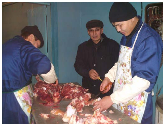
Figure 4. Deboning Carcasses of Young Animals