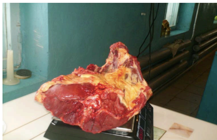
Figure 3. HCV Distribution by Genotype