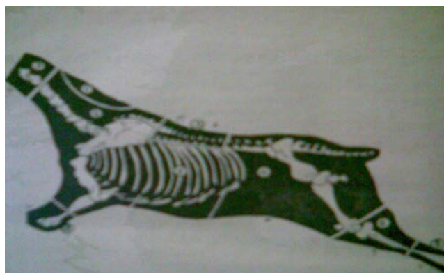
Figure 1. Diagram of Cut Carcasses of Horse (PCT of Kazakh SSR 725-72)

Lines cut off desperately relating to the third class, passes between the occipital bone and the first cervical vertebra, the posterior border of the desperate cut is between the 2nd and 3rd cervical vertebrae. The front of the shank is separated by the line through the middle of the ulna and radius, the Shin part of the lower half of the elbow and the lower half of the radial bone and wrist. The shank is separated across the back of the tibia at the level of 2 cm above the Achilles tendon. The rear shank includes the lower half of the tibia and hock.