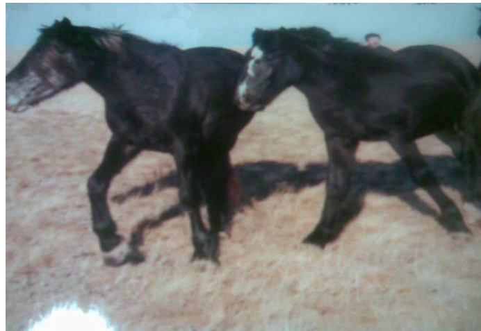
Figure 1. Mixed Young 7 Months Before Slaughter