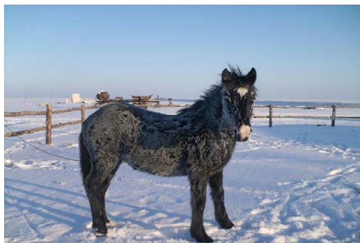
Figure 2. Mixed Young 18 Months of Age